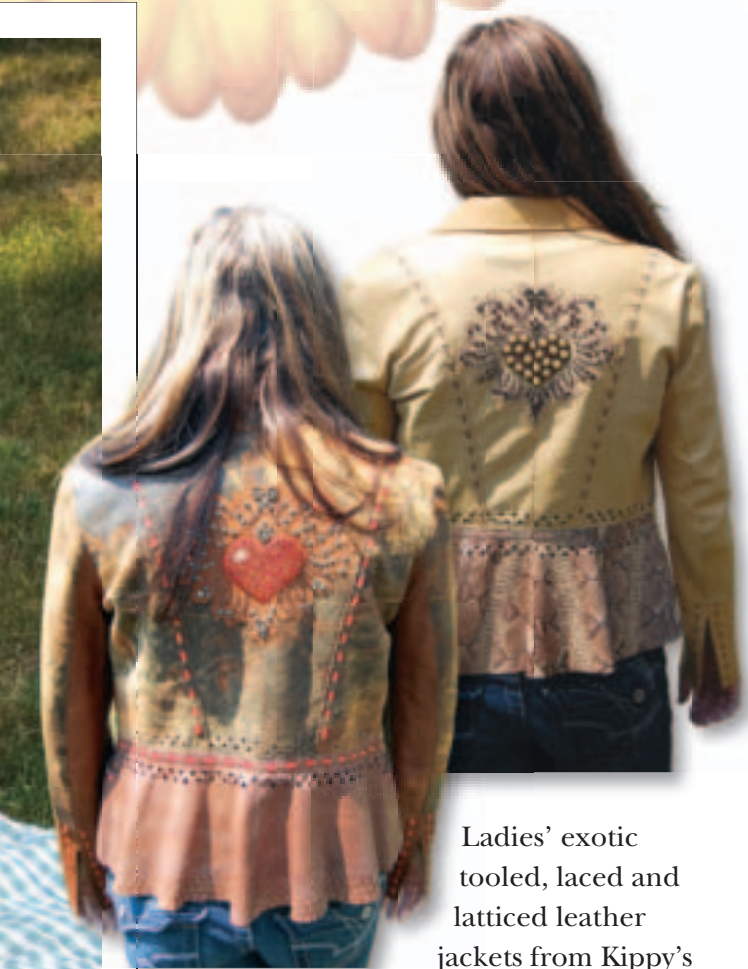
Ladies' exotic tooled, laced and latticed leather jackets from Kippy's have an intricate crystal and beaded heart design on the back. www.kippys.com

Tan and pink John Deere boots. www.danpostboots.com