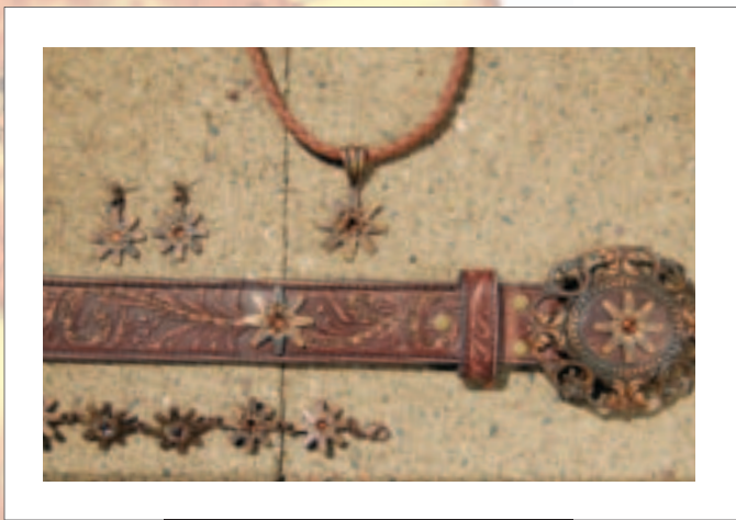
← Matching rowel-design earrings, pendant necklace, bracelet and tooled, studded belt from M&F Western are accented with rhinestones and crystals. www.mfwestern.com